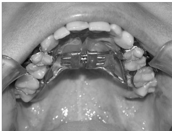
Figure 2. Cemented Hyrax-type expander apparatus (tooth-borne) on teeth before the maxillary expansion procedure.

techniques have been described in the literature. 8-10 The third method for rapid maxillary expansion is to use surgery alone; this procedure is named maxillary expansion by segmented osteotomy. Expansion is attained in this procedure without using any expander; it is done only with segmented osteotomies of the maxilla, and is indicated for transverse deficiencies measuring not more than 7 mm and that are associated with other maxillary deformities requiring surgical correction. 11