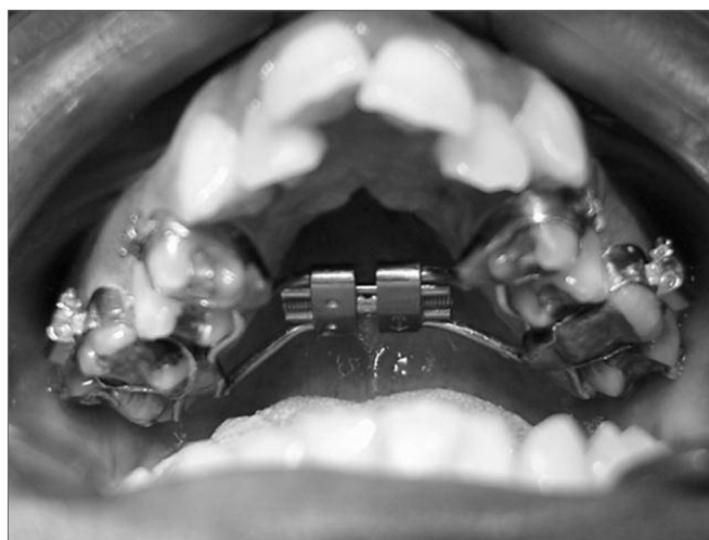
Figure 3. Cemented Haas-type expander (tooth tissue-borne) on teeth before the maxillary expansion procedure.

When the required amount of maxillary expansion is attained the expander should be blocked and kept in position during a 3 to 6-month retention period, depending on the expansion technique and bone neoformation along the midpalatal suture, which may be monitored radiographically by occlusal maxillary radiographs (Fig. 4). The