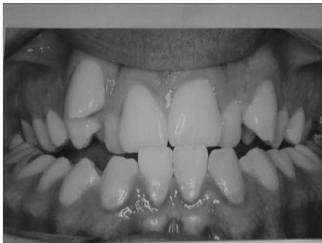
Figure 1. Frontal view of dental occlusion in a patient with maxillary atresia. Note the presence of bilateral posterior crossbite and anterior dental crowding.

The transverse maxillary deficiency is the most frequent maxillary deformity. Patients with this deformity usually presented unilateral or bilateral posterior crossbite and anterior dental crowding (Fig. 1). The distance between the lateral walls of the nasal cavity and the nasal septum is often decreased in the transverse maxillary deficiency. This reduction increases the resistance to nasal airflow and causes nasal respiratory difficulties. 5,6